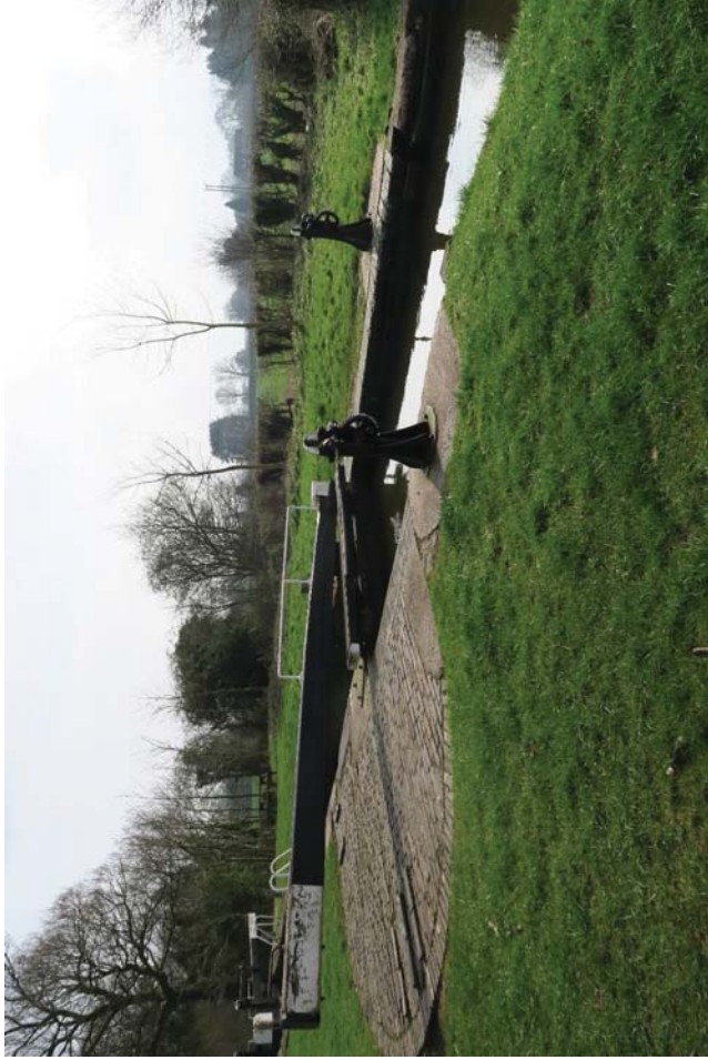
Map Group Q.1 Brick Kiln Lock (Number 33) (Locally Listed Grade A)