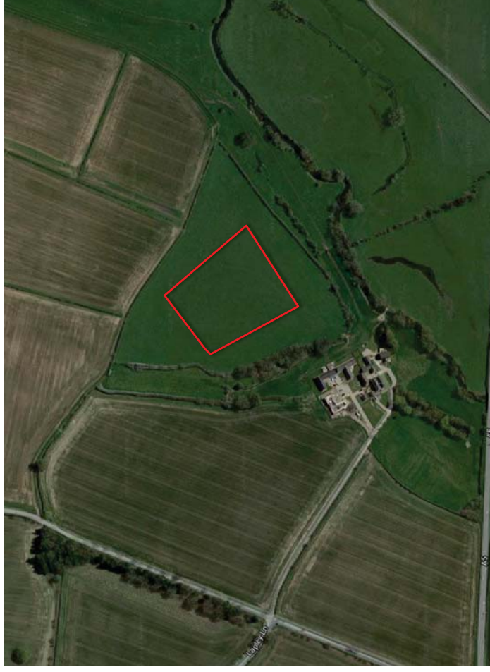
Map Group F.4 Camp north east of Stretton Mill (Scheduled Ancient Monument). Indicative boundary shown in red