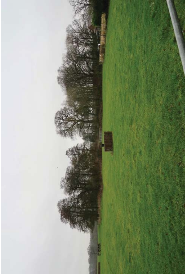
Map Group G. Rodbaston Old Hall moated site and fishpond (Scheduled Ancient Monument)