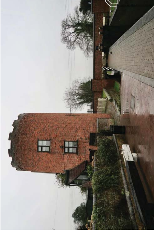
Map Group M.1 Round House (Grade II)