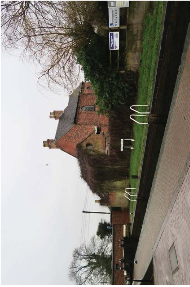
Map Group M.2 Wharf Cottage (Grade II)