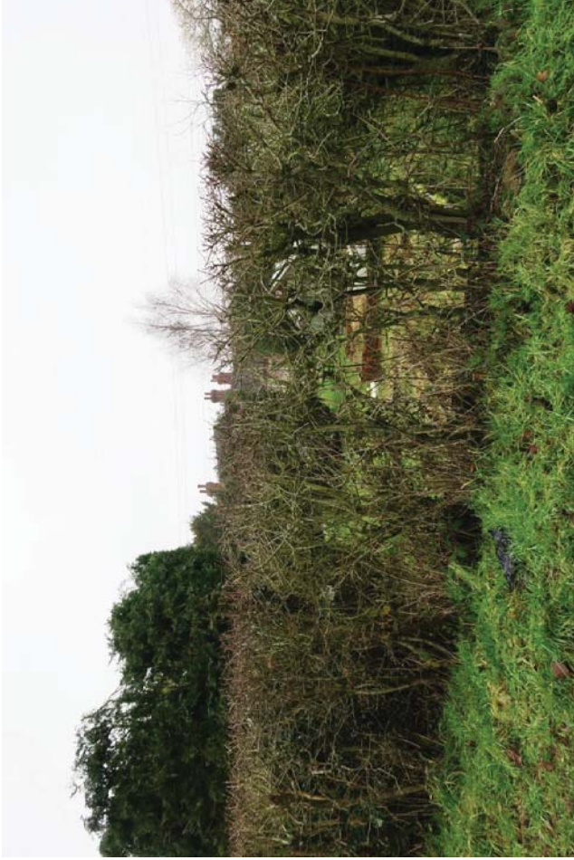
Map Group N. Aspley Farnhouse (Grade II)