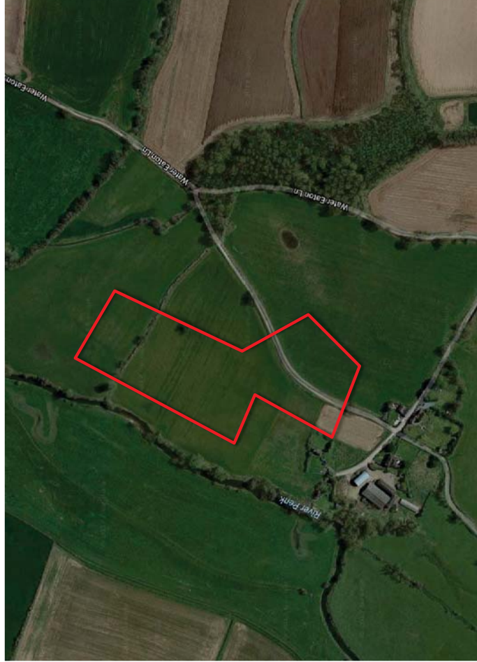
Map Group F.1 Two Roman camps north of Water Eaton (Scheduled Ancient Monument). Indicative boundary shown in red