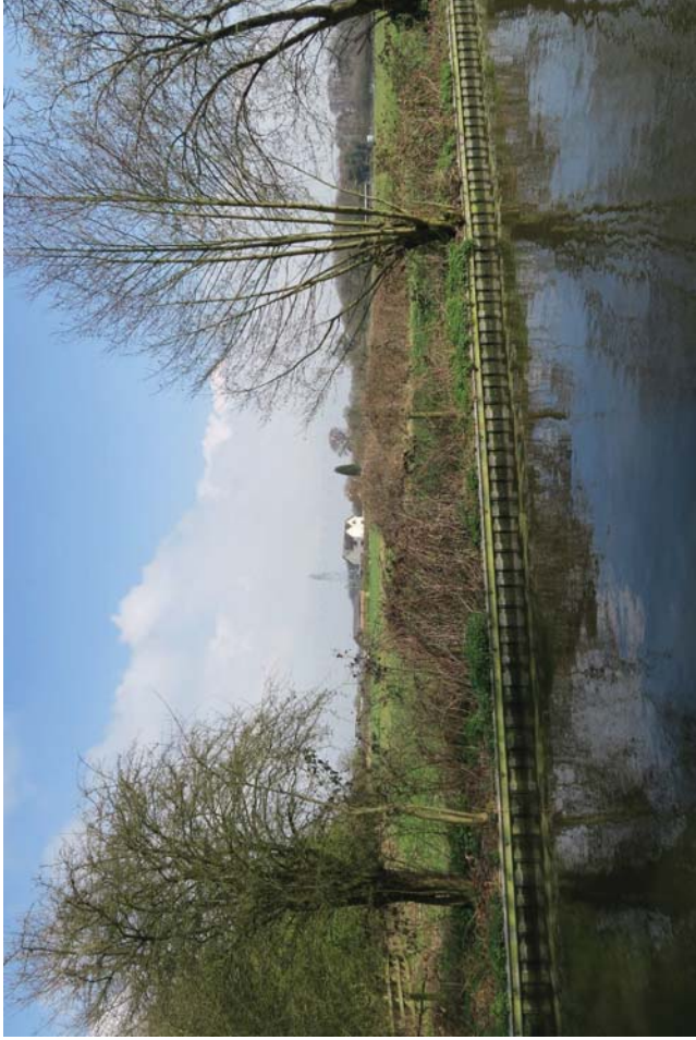
A.3 Calf Heath Bridge to Long Moll's Bridge (southern section)