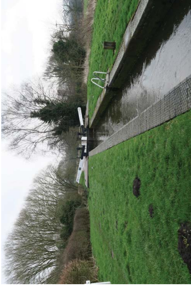
Map Group Q.2 Bogg's Lock (Number 34) (Locally Listed Grade A)