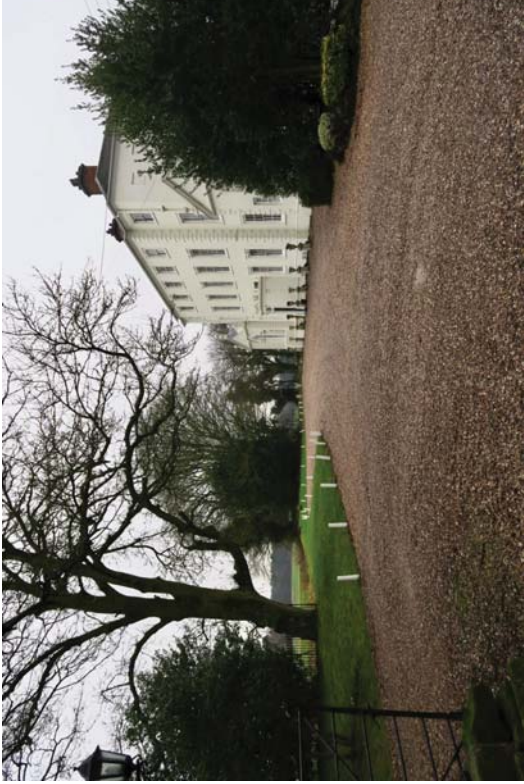
Map Group 1. Somerford Hall (Grade II*)