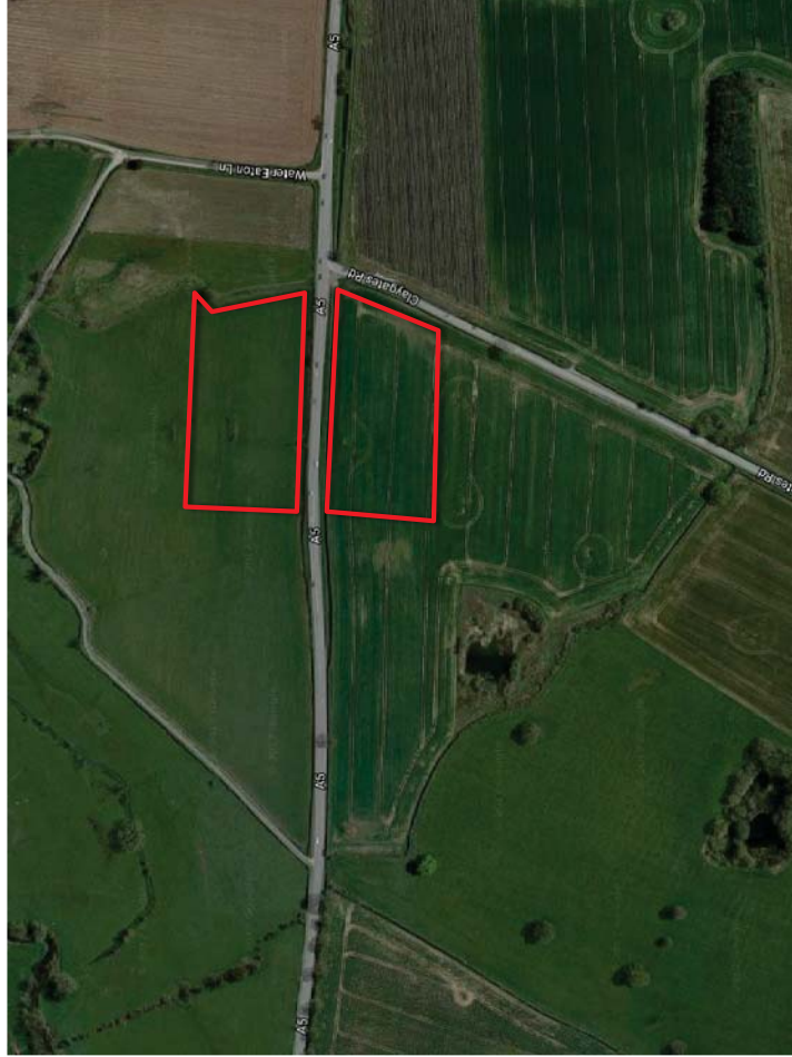
Map Group F.5 Site of Pennocrucium, east of Stretton Bridge (Scheduled Ancient Monument). Indicative boundary shown in red