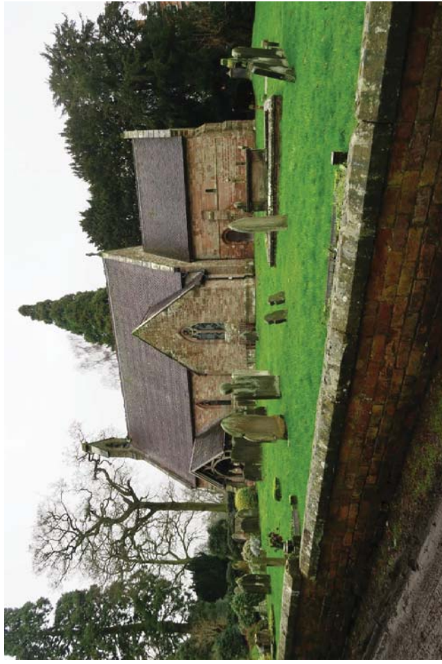
Map Group J.2 Church of St John, Stretton (Grade II*)