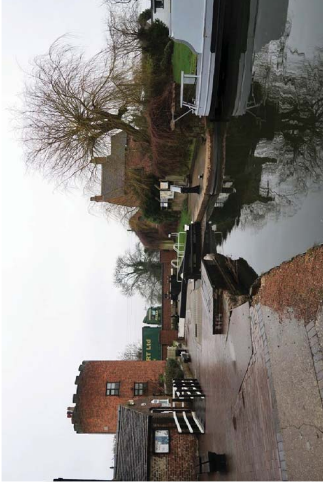
Map Group M.3 Gailey Lock (Number 32) and Gailey Bridge (Number 79) (Locally Listed Grade A)