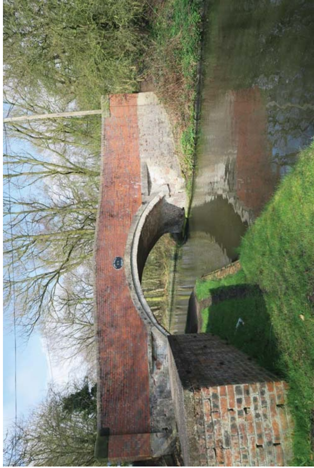
Map Group O.1 Long Moll's Bridge (Locally Listed Grade A)