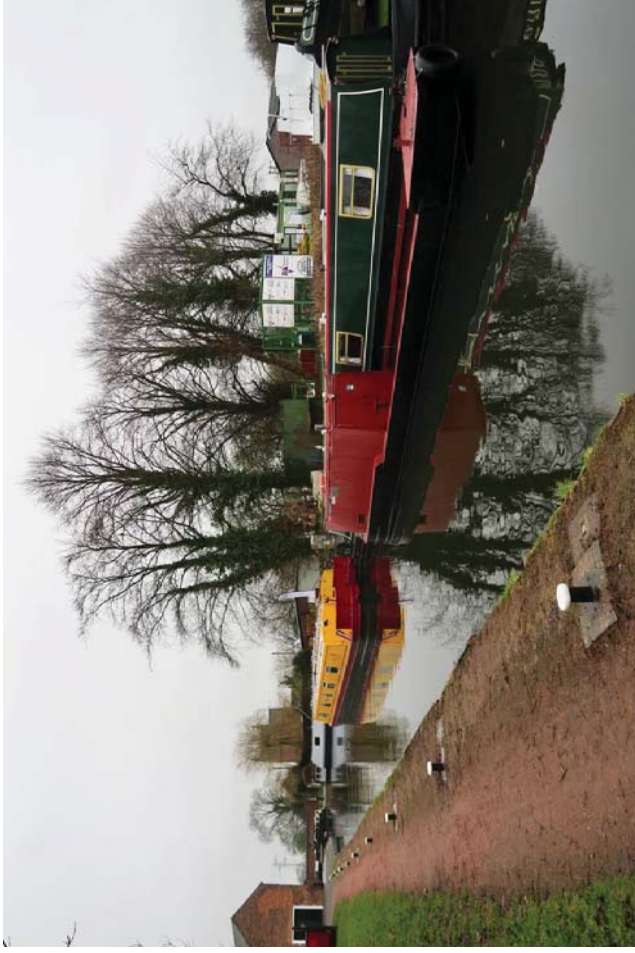
Map Group M.4 Gailey Wharf (Locally Listed Grade A)