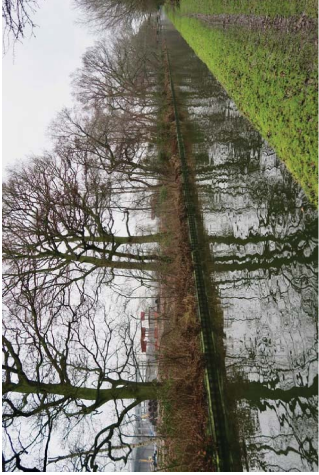
A.2 Gravelly Way Bridge to Calif Heath Bridge (central section)