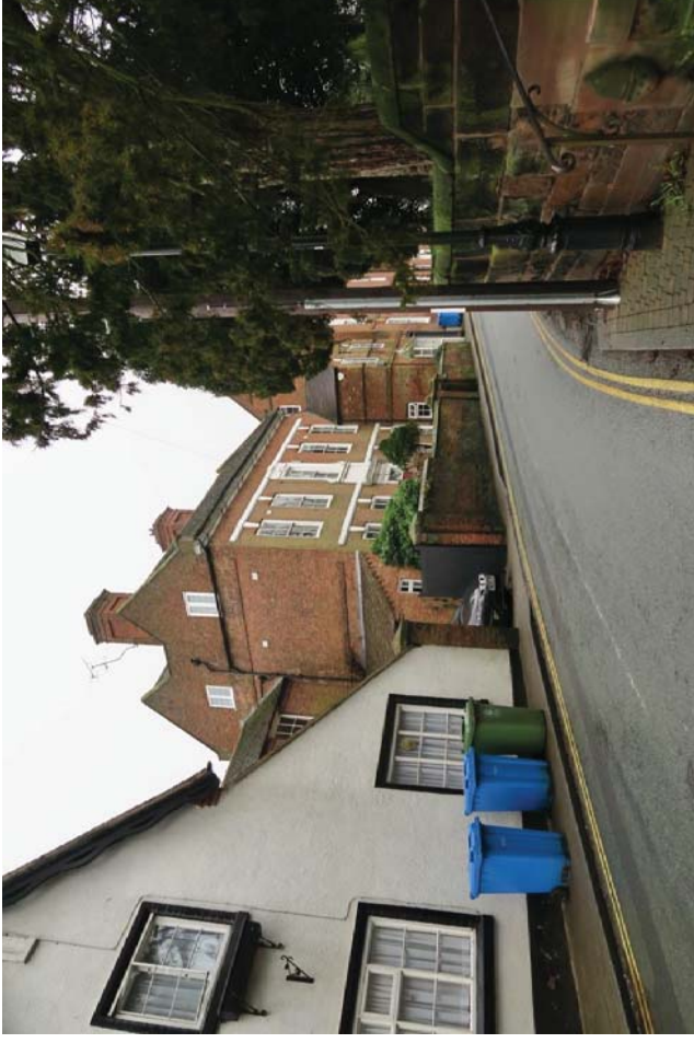
Map Group H.2 Westgate, Forecourt Wall and Gate Piers (Grade II*)