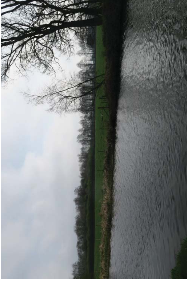
A.4 Gailey Wharf to the M6 Motorway