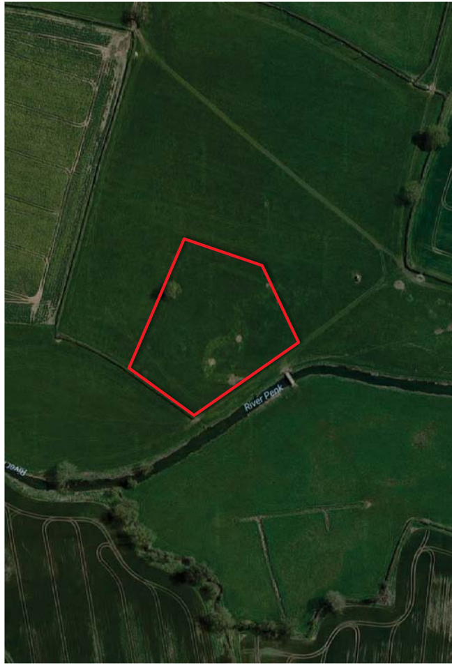
Map Group F.6 Roman villa 300yds (270m) NW of Engleton Hall (Scheduled Ancient Monument). Indicative boundary shown in red