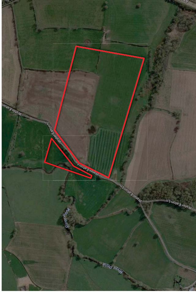
Map Group F.3 Roman Camp, Kinvaston (Scheduled Ancient Monument). Indicative boundary shown in red