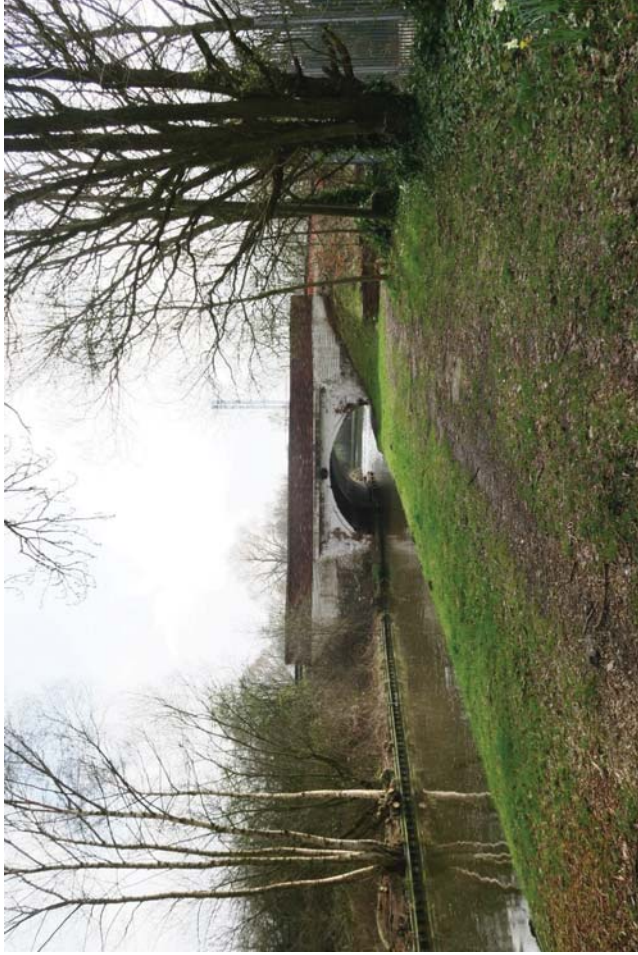
Map Group P. Calf Heath Bridge (Locally Listed Grade A)