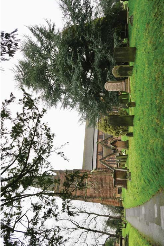
Map Group H.1 Church of St Mary and St Chad, Brewood (Grade I)