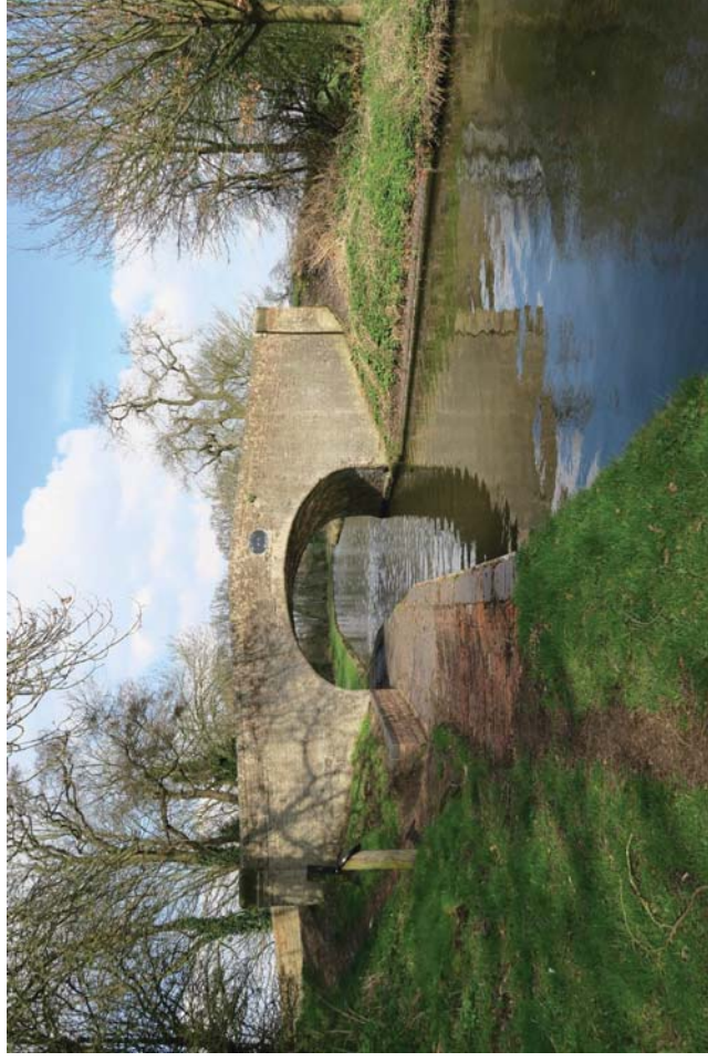
Map Group O.2 Deepmore Bridge (Locally Listed Grade A)