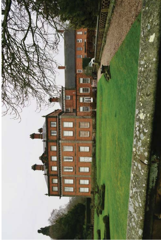
Map Group J.1 Stretton Hall and Combined Service and Stable Wing (Grade II*)